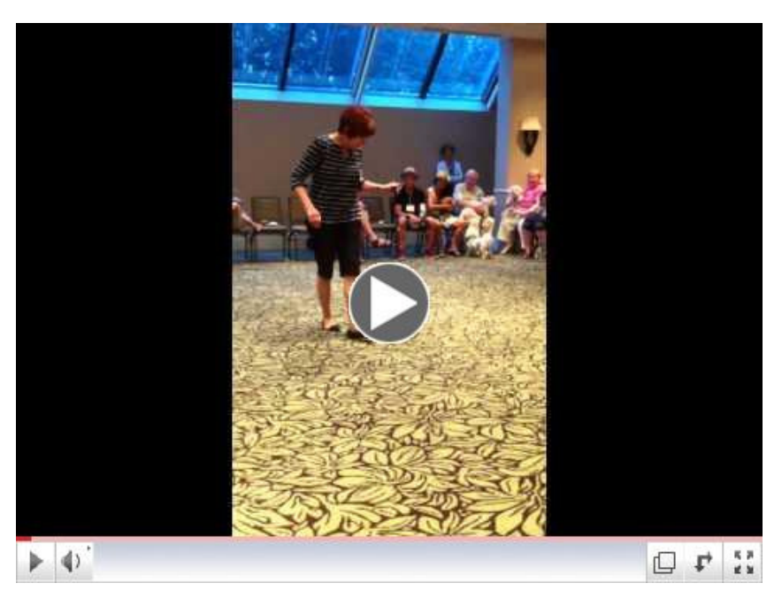
Havanese Rescue 2012 Parade

volunteer application adoption application