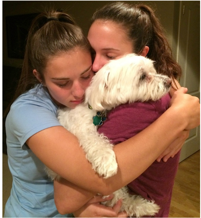
HRI dog Muppet and his new sisters know good hugs.

Hoping to find "The One" this Valentine's Day? Me too! My name is Lola Belle and I am looking for my perfect match. I am nine years old, but you would never know it. I have a lot of energy and love to be in the middle of the action. Do you like tricks? I can sit, stay, lie down, shake, roll over and come when called. I'd love to learn more tricks with my new family. I'm also an excellent dancer. Bring out the treats, and I'll show you what I mean. I get so excited when my foster mom is making dinner that I've just got to dance! I am also house trained, leash trained and crate trained. (I was thinking of leaving that last one off because I'd really like to sleep in bed with you.)