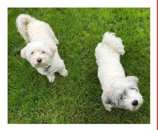
Diamond and Dozer running through the grass.